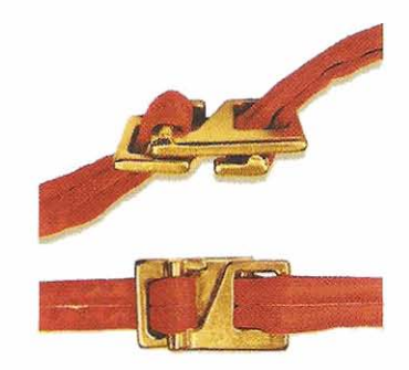
Connect Two Slings