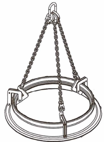
Optional 3-Leg Model