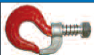
GATE HOOK - U Hook latch revolves on hook shank and locks under spring tension in open or closed position.