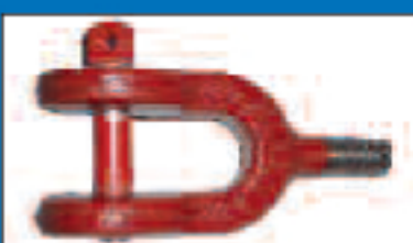
CLEVIS JAWS - PS Jaw fitting provides absolute attachment, high strength forged steel jaws and screw pins.